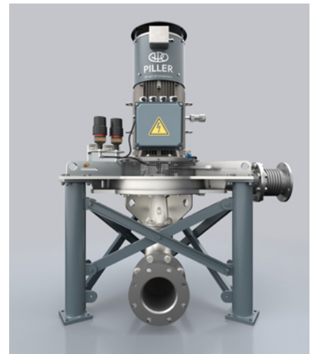
PILLER VapoFan single stage