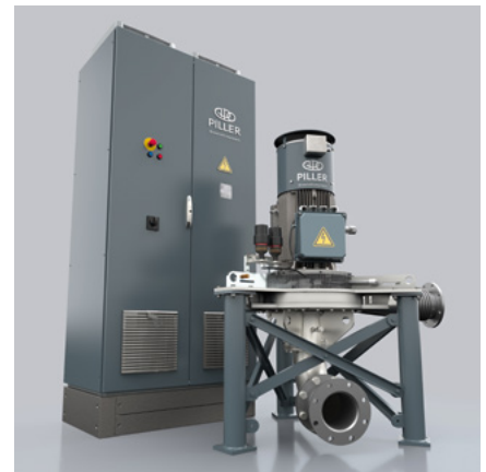
VFD Cabinet for PILLER High Speed Motors