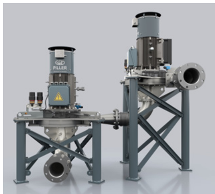
VapoFan 2-stage design